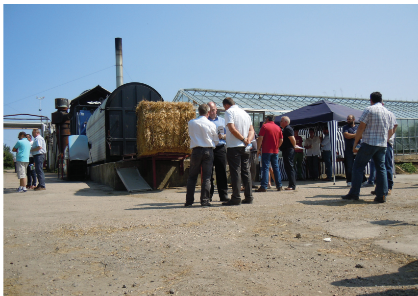
A Straw boiler open afternoon earlier in the year.

to fit in exactly with our customer's needs. We can provide significant fuel cost savings by converting an old heating system to straw and I would expect the likely pay-back through the RHI payments to be in the region of four years. In addition to cost savings, straw-fired boilers help "tick the box" in the ever increasing list of environmental requirements for produce".